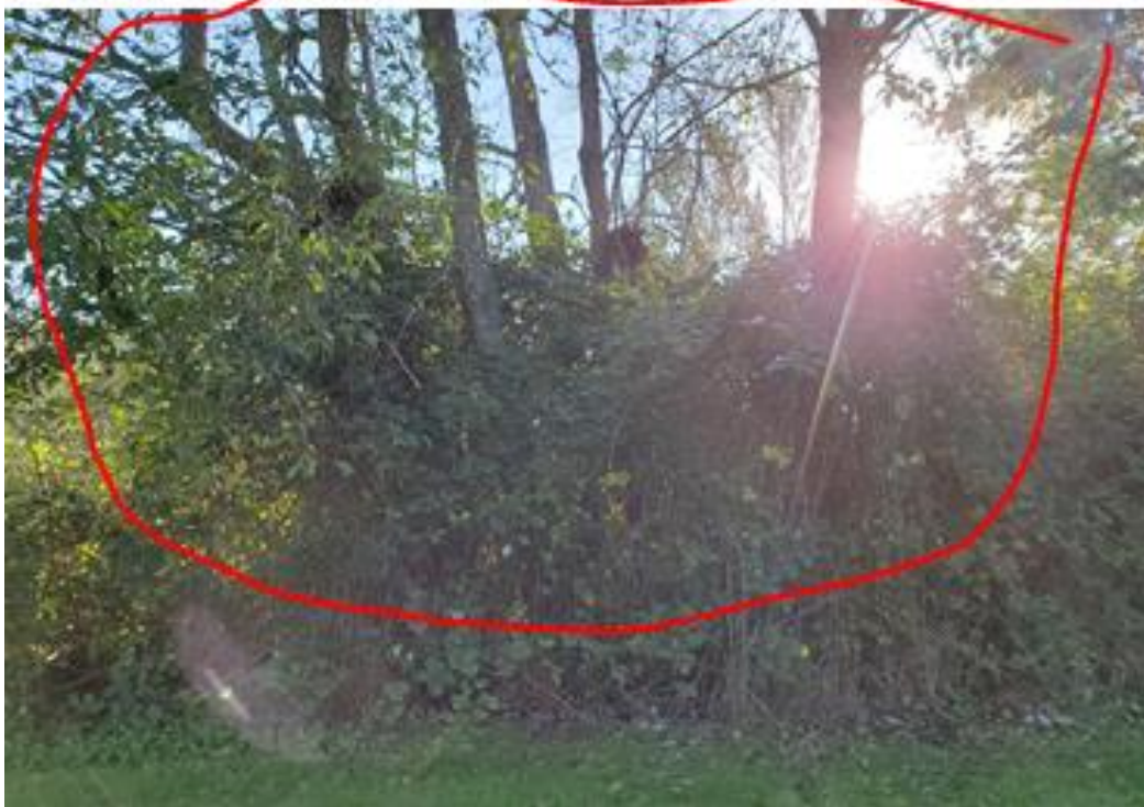
The extreme left and right of this cluster of (6) trees are marked with grey spray paint. The (4) in the middle with bases covered by blackberry brambles yield the (10) in scope.