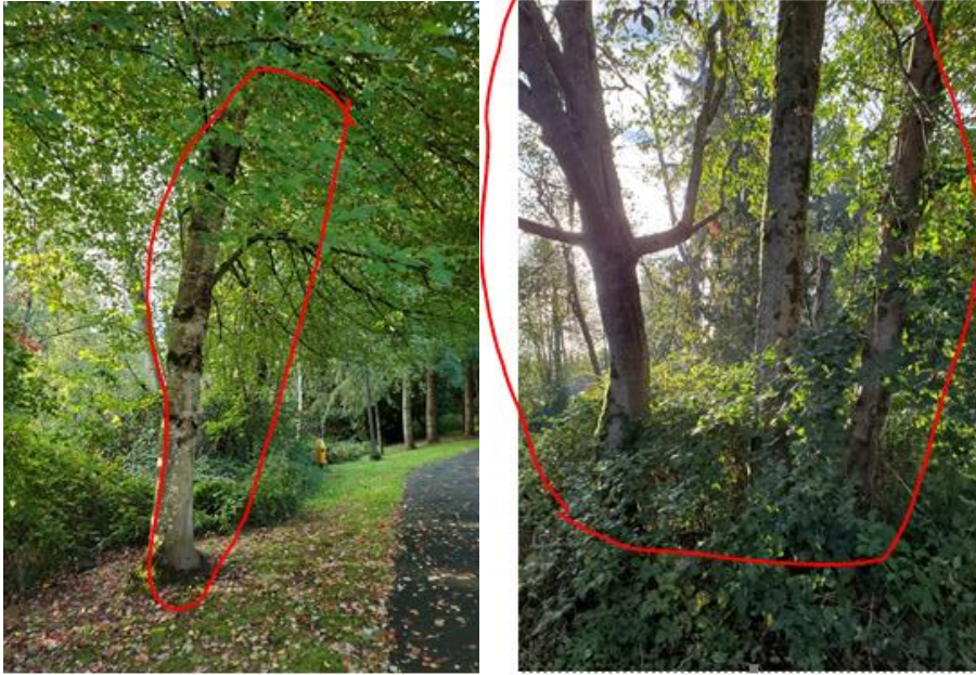
The above (4) are marked with grey spray paint and near each other.