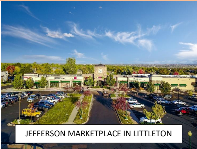
JEFFERSON MARKETPLACE IN LITTLETON