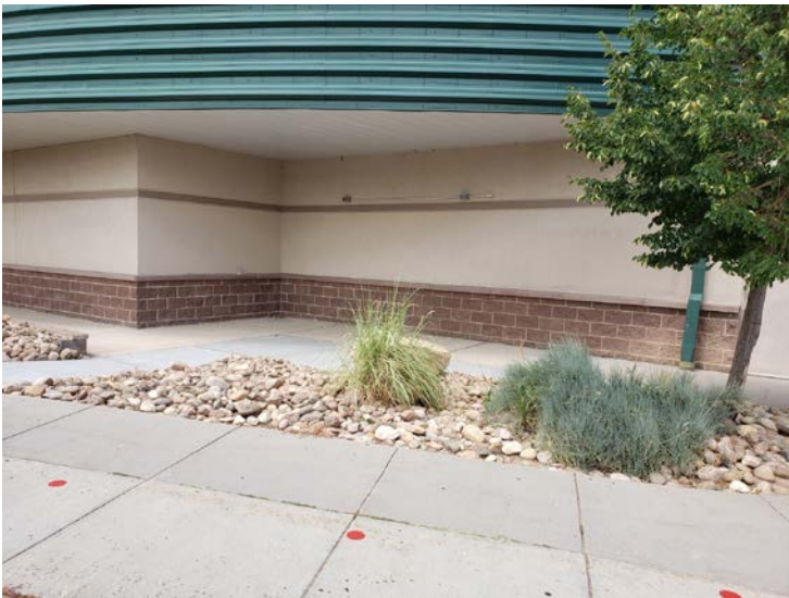
New Location for Lockers and Lending